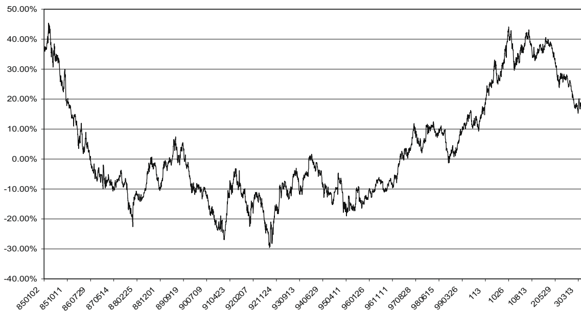
Fig. 2. Misalignment of the Euro against the USD (in percent).

begins in mid 1998 and persists until the end of the sample (May 2003).